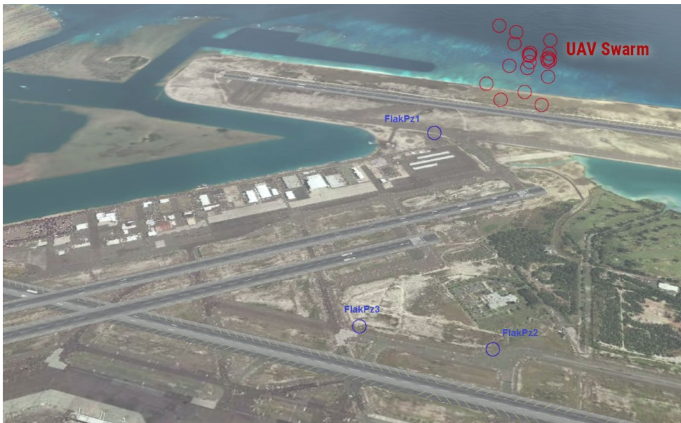
Figure 2: AAA platforms (blue) defend airfield against aggressor swarm (red).